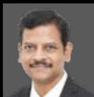
Dhanasekara Raja Education Chair